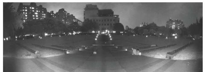
Panoramic IR Illumination