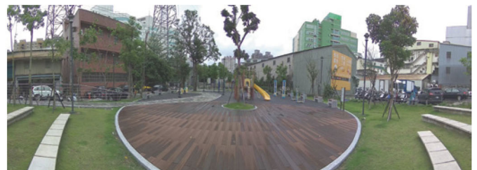
8MP Panoramic View