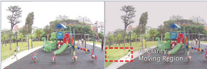
Without Smart Stream II