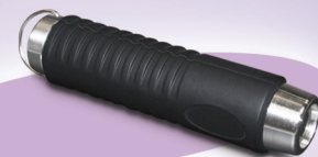
EPS-5000 Patrol Probe

* All Specifications / colors are subject to change without notice. (V.02)