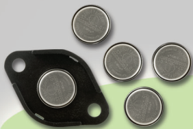
EPS-B5 Read Button