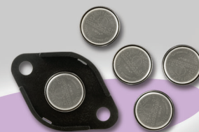
EPS-B5 Read Button