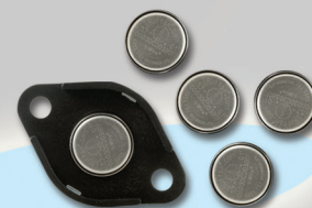
EPS-B5 Read Button