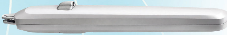
Gate Opener SG201